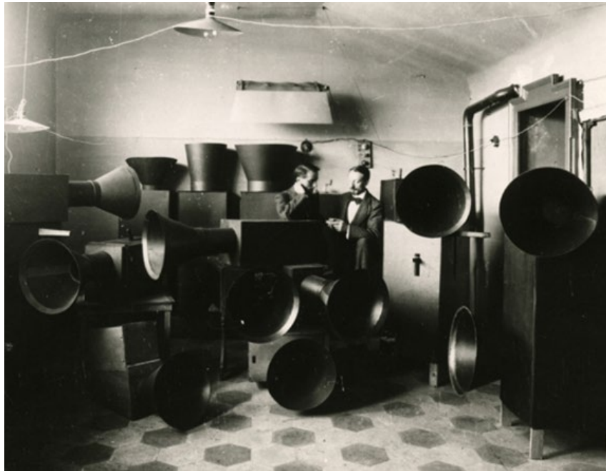
Luigi Russolo and Ugo Piatti with noise machines, Milan, 1913. Reproduced in L'Arte dei rumori ( The Art of Noises ), 1916. Public Domain.