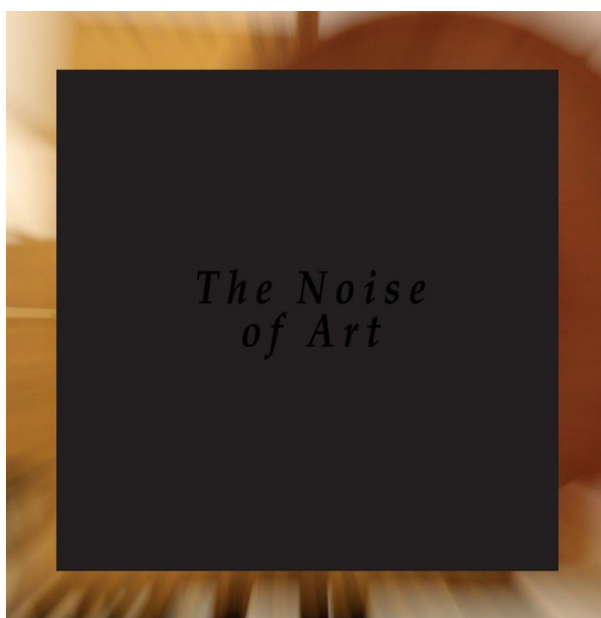
The Noise Of Art: Works for Intonarumori (Sub Rosa LP/CD cover)